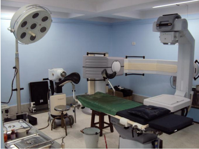
Integrated Brachytherapy Lab.

Applications of radioisotopes in medicine Radiation hazard evaluation and control Exhaustive Experiments Demonstrations Visit to Hospitals Training in the clinical situation