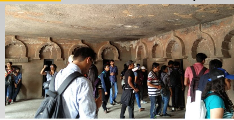
Field Work in Central India- Sites Visited: Ajanta, Ellora, Daulatabad & Mandu.