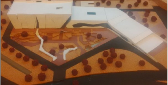
8th June 2017